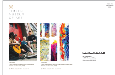
9 x 12 Envelope $20.67 per 1,000*