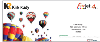
#10 Envelope $10.51 per 1,000*