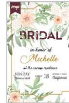
4" x 6" Postcard $5.71 per 1,000*

*Consumables cost includes ink, maintenance, waste ink, and replacement print head. Based on running at 1600 x 954 dpi at 150 ft./min.