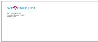
#10 Envelope $1.40 per 1,000*