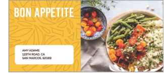
#10 Envelope $38.99 per 1,000*