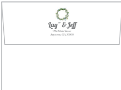
A7 Envelope $1.54 per 1,000*